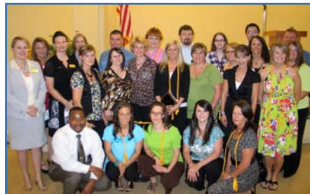
Phi Theta Kappa Honor Society members at the 2011 Awards Ceremony