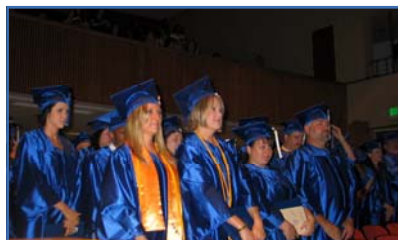
2011 OTC Graduates moments after "turning the tassel"