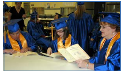
Graduates review the program prior to the ceremony